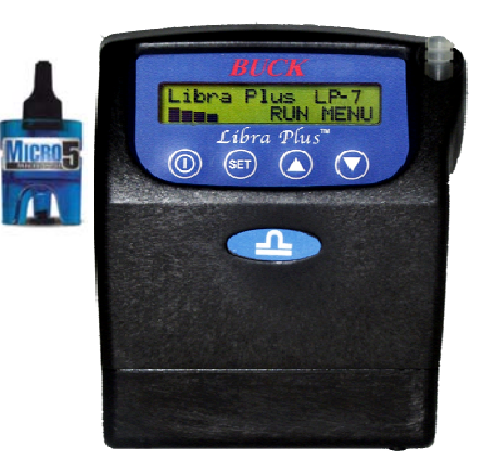
Flow Range 3 to 7 LPM

Other features include elapsed time, flow rate, and accumulated volume. The built in timer counts down the sampling time up to 40 hours, and automatically turns the pump off. All data is saved, and cleared, for the next sample under the MENU "Clear All Data" option.